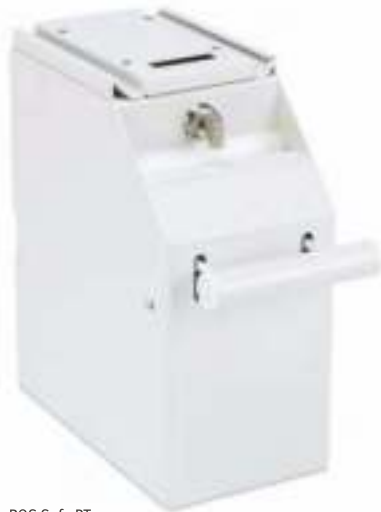
POS Safe RT 500