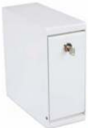
POS Safe RT 600