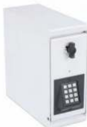
POS Safe RT 700